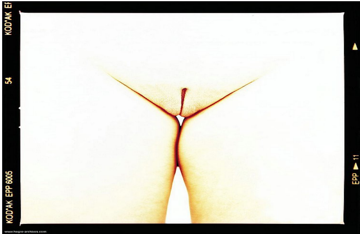
Petter Hegre's Y Project Collection